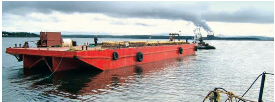
Fig. 4 A partial shipment of spools departs by barge from Pictou. The spools are enroute to Mulgrave, NS.