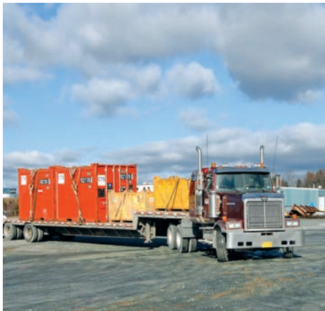
Fig. 4 Moving containers bound for Deep Panuke from the yard to the quayside.