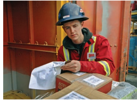
Fig. 3 Checking materials to load to a container headed for Deep Panuke.