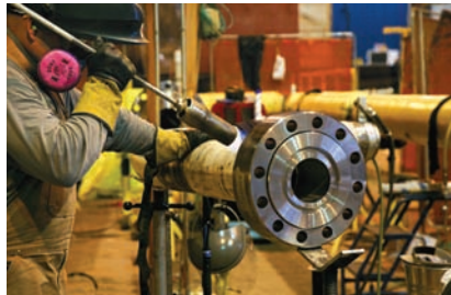
Fig. 2 Preheat is applied to the neck of a flange prior to welding.