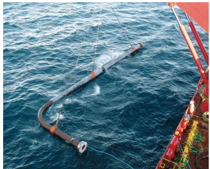
Fig. 6 The closing spool for the gas export pipeline (GEP) is overboarded from the Aceryg Discovery . Connecting this final spool was the last step to complete the GEP from the production platform to Goldboro, NS.