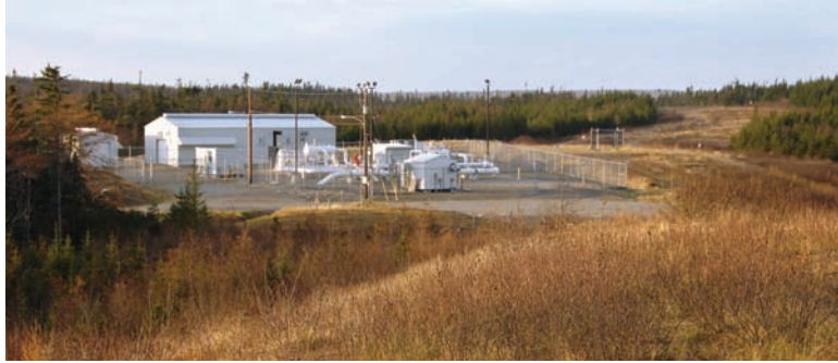
The terminus for the Deep Panuke pipeline meets up with the Maritimes & Northeast Pipeline (M&NP) system at this site in Goldboro, NS. In the background is the corridor for M&NP stretching back across Northern Nova Scotia. Work on the terminus was completed in late 2011 to prepare for first gas from Deep Panuke. Final steps to commission the facility are now taking place to lead up to first gas.