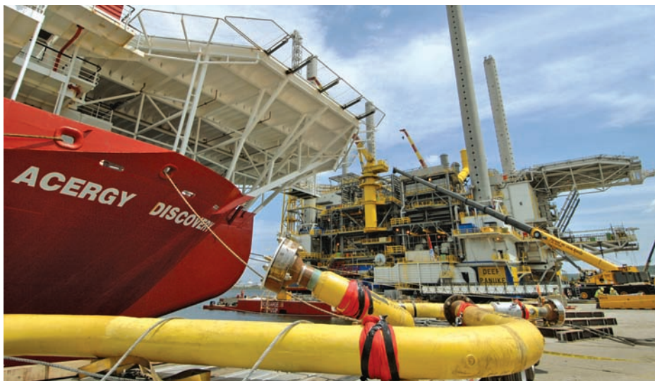
Fig. 5 Completed spools quayside await loading to Subsea 7's Aceryg Discovery at the Mulgrave Marine Terminal (part of the Strait Superport) at Mulgrave, NS. In the background is the Deep Panuke production platform, moored temporarily at Mulgrave in the summer of 2011 prior to its tow and installation in the field.