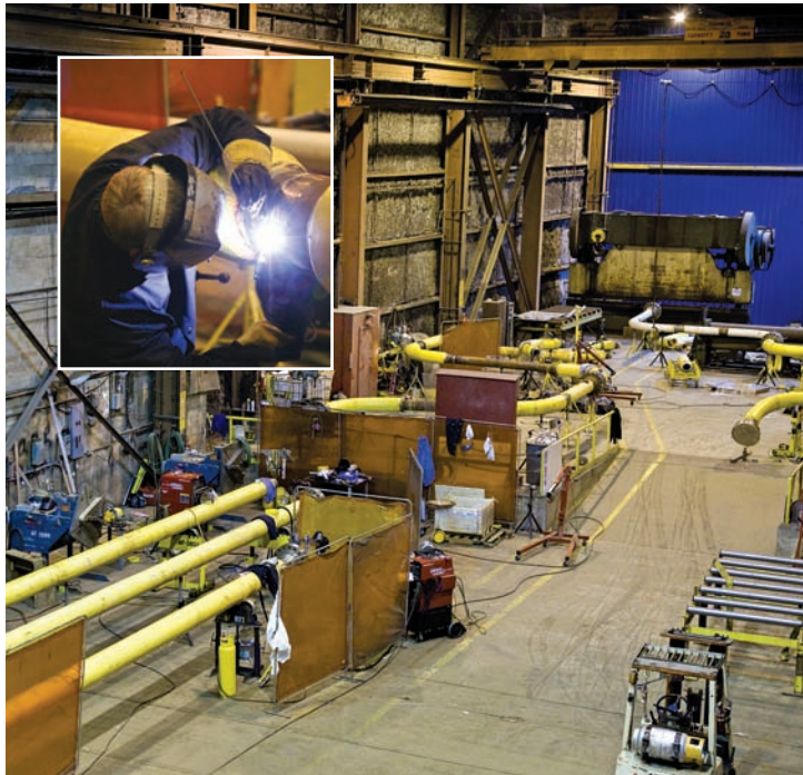
Fig. 1 At the Aecon fabrication shop in Pictou, NS, the yellow spools for the production flowlines are fabricated. Special welding techniques join the pipes, bends and flanges together.

Offshore at Deep Panuke, each spool was overboarded to the seabed from the Aceryg Discovery (Fig. 6). At the seabed, saturation divers made the final alignment and bolted connections using the flanges to join all the pieces together.