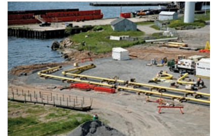
Fig. 3 Pressure testing and weighing of the spools takes place in the yard at Aecon's shop in Pictou.