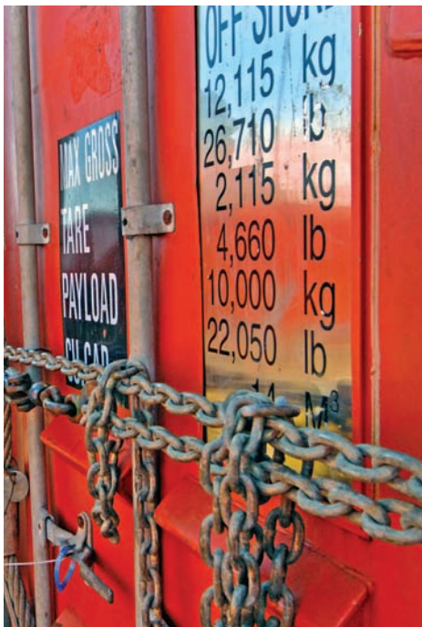
Fig. 6 Secured container on the Atlantic Condor .