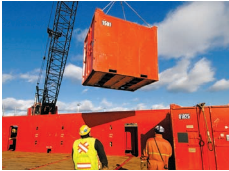
Fig. 1 Loading containers to the Atlantic Condor at the offshore supply base.

Have a question? Contact us at dpinfo@encana.com