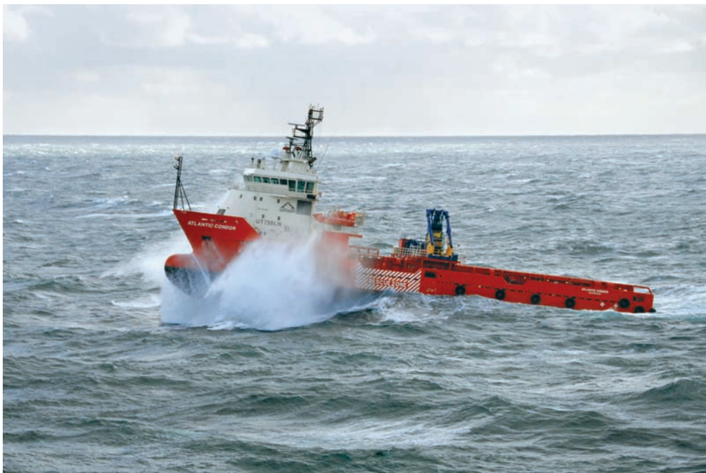
Fig. 7 The Atlantic Condor at Deep Panuke.