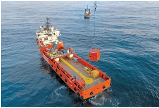
Fig. 2 The Atlantic Condor offshore supply vessel at work at Deep Panuke.